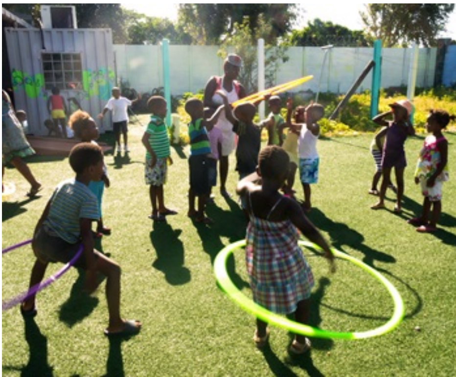
Class B8 is part of Project Playground's Play and Learn programme. Here the children try out hula-hooping on the playground. In the background is the container, where children can go if they want a peaceful area to read or relax.